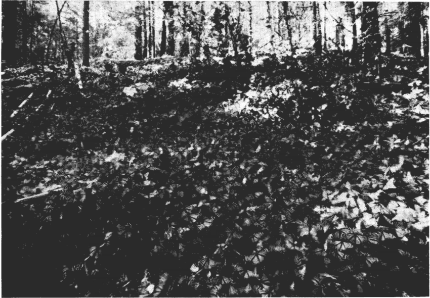
Fig. 1. Thermoregulatory struggle of more than 10,000 monarch butterflies which released their grip in response to smoke from a small fire (less than one meter in diameter) which drifted laterally and upwards through the clusters in the trees. The ambient temperature in the forest was about 13°C at the time of the incident (ca 1500), 2°C below the thoracic temperature at which monarchs are able to fly. Original 35 mm Kodachrome by George D. Lepp.

creek and many thousands were drinking at moist spring sites and along the creek itself.