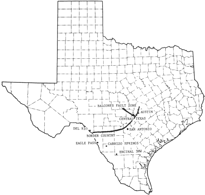
FIG. 1. Base map of Texas, showing localities discussed in text. Solid line is Balcones Escarpment Zone; arrow indicates general direction of snout butterfly migration; names refer to weather station locations.

Central Texas was transformed from drought to lush conditions in a very short period of time. Plants put on new growth (up to 1 m branch growth in C. laevigata ); insect populations increased dramatically. Various bird species, whose nesting had been curtailed by the dry spring and early summer, responded with late nesting attempts (Webster, 1972). Impact of the 1971 drought and heavy rain conditions affected the population dynamics of various lizards (Clark, 1976; Martin, 1977), snakes (Clark, 1974; Clark & Fleet, 1976) and small mammals (Beasom & Moore, 1977).